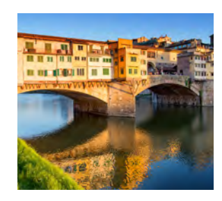
MAGIC® VERONA 15.5 MIL (VERONA250HD) 19.5 MIL (VERONA285T) 16.5 MIL (VERONA300RAG) 100% COTTON RAG