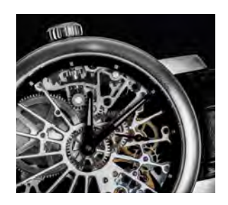
MAGIC® SIENA 8 MIL (SIENA200) 10 MIL (SIENA250) Photo Paper