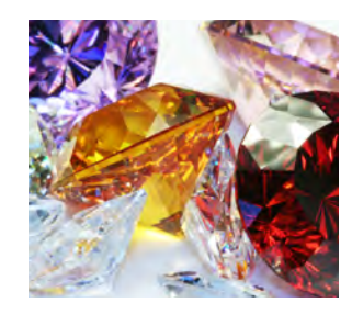
MAGIC® FIRENZE 6.5 MIL (FIRENZE132) 8 MIL (FIRENZE170) Premium Paper