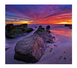
MAGIC® DMIBOP 11 MIL Wet Strength Paper