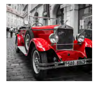
MAGIC® GFIOP 6 MIL (GFIOP140) 9 MIL (GFIOP212) Wet Strength Paper