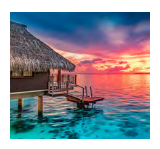
MAGIC® POSPRO+200 10.5 MIL Anti Curl Blockout Film