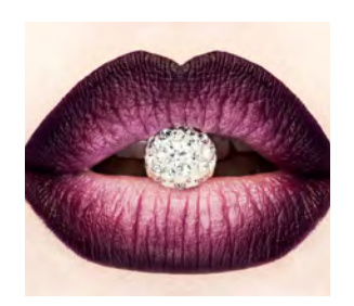
MAGIC® DMVLA5 6 MIL Calendared Vinyl with Permanent PSA