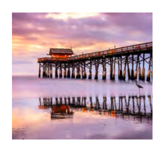
MAGIC® SIENA200PSA 8 MIL Photo Paper with Permanent PSA