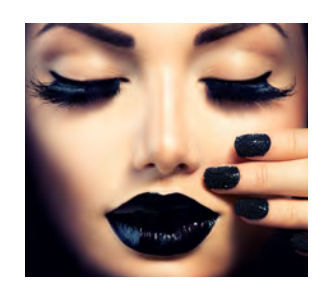
MAGIC® SBL7 8 MIL Backlit Film