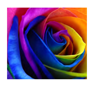
MAGIC® STICK2 6 MIL Polypropylene Film with Low Tack PSA