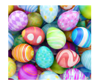
MAGIC® FAB6 7 MIL Polyester Woven Fabric