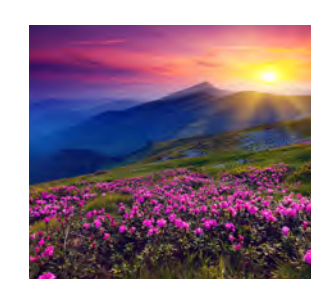
MAGIC® TORINO17M 17 MIL Poly/Cotton Canvas