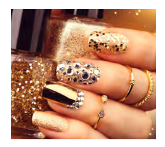
MAGIC® GFPHOTO 7 MIL (GFPHOTO) 10 MIL (GFPHOTO240) Photorealistic Paper