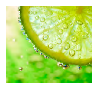
MAGIC® PPM7 9 MIL Polypropylene Banner